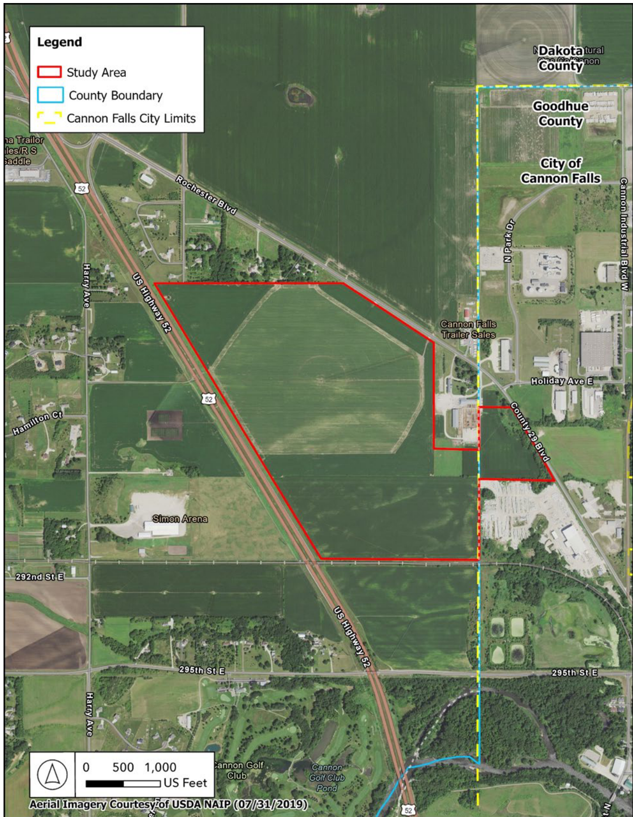
Figure 1: AUAR Study Area