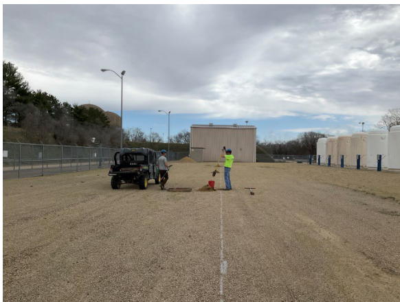
Photo 5.0-1. Overview of Project Area, Facing West.