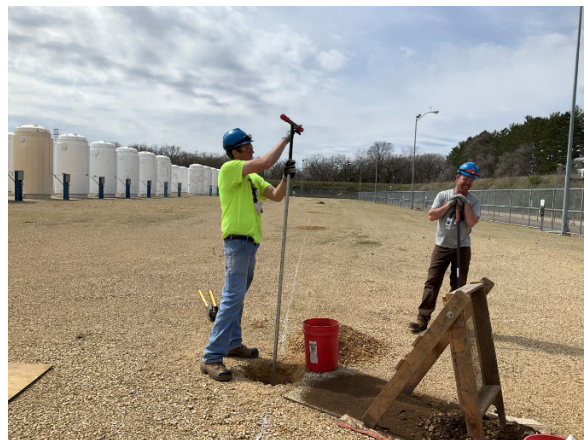
Photo 5.0-2. Westinghouse Personnel Using Bucket Auger.