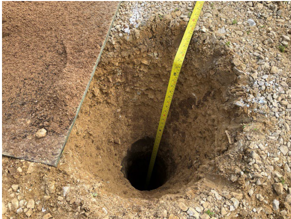
Photo 5.0-3. Shovel Test Excavation Number 2.