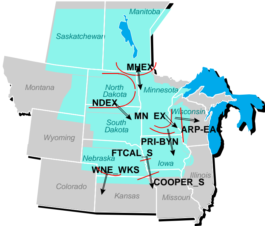
Figure ES- 1

The change in flow on each flowgate due to the addition of a reinforcement plan to the system was determined by measuring the before and after reinforcement flow at a transfer level of 3000 MW (2000 MW western transfer / 1000 MW southern transfer). These results demonstrate that most reinforcement plans reduce flow on the MAPP flowgates as they are defined today 1 . The results are shown in Table ES-1 (rows h-l).