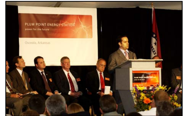
Plum Point Groundbreaking Ceremony