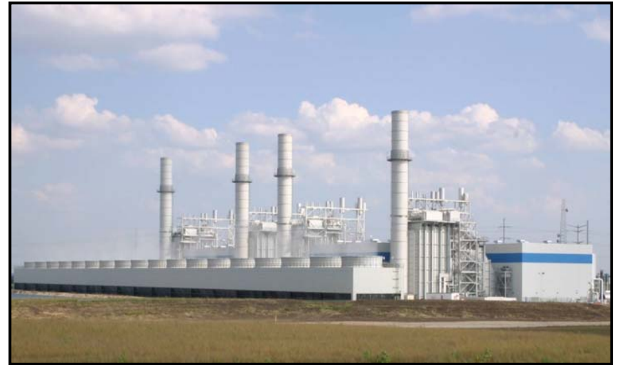
Kendall County, IL 1160 MW