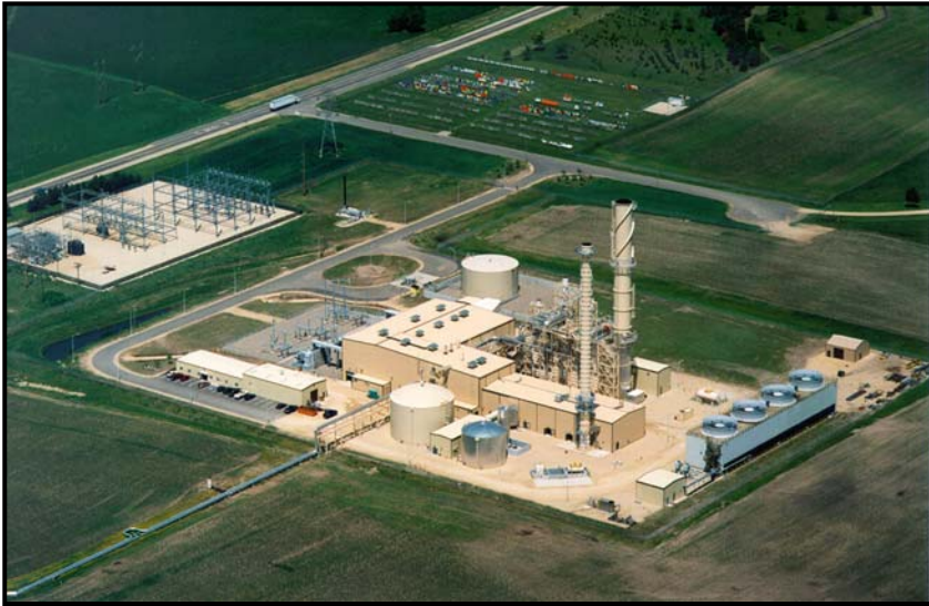
Cottage Grove, MN 245 MW